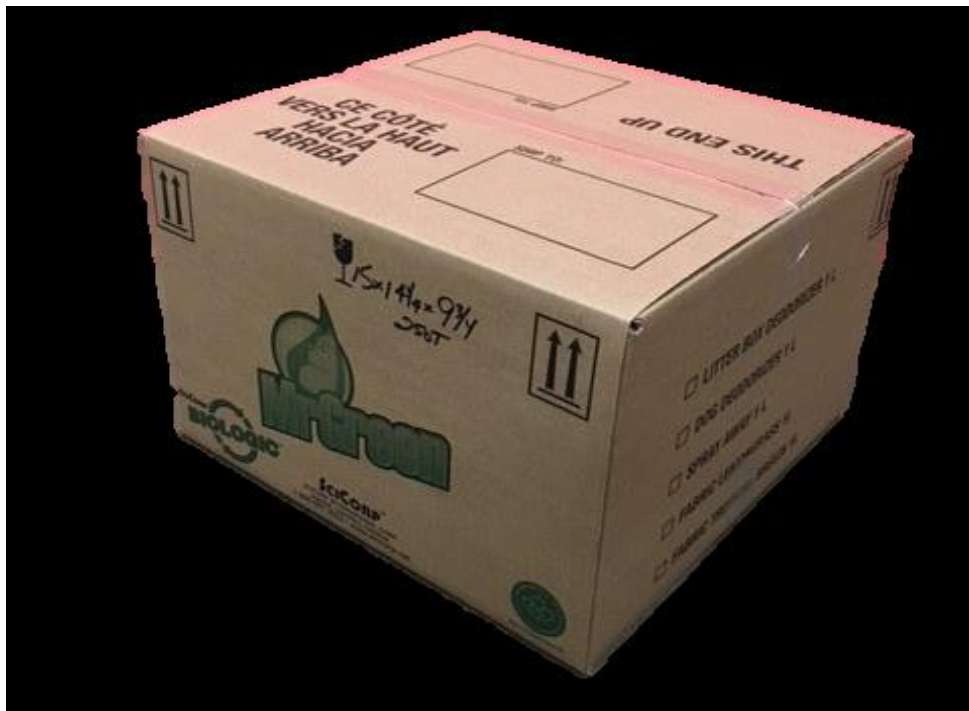
New Printed Box - 15 x 14.25 x 9.75 - 275T/44ECT