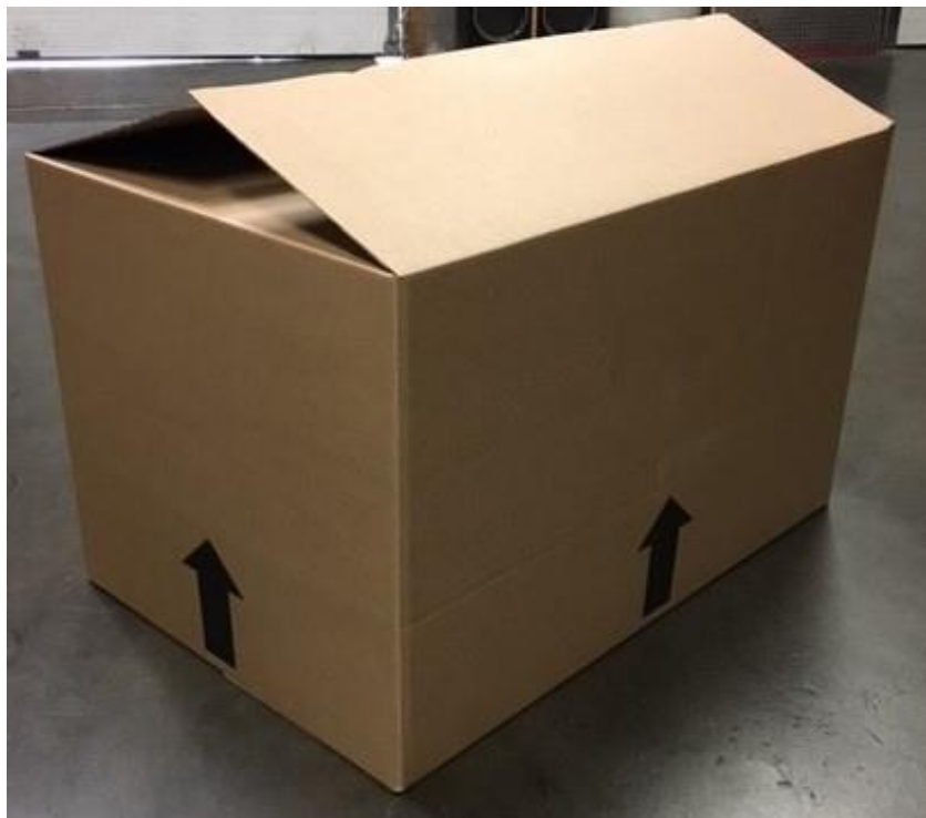
New Plain Box - 46.5 x 31 x 30.5 - 275T/44ECT